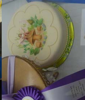
2009 Cake Show Best of Show by member Pat Straub